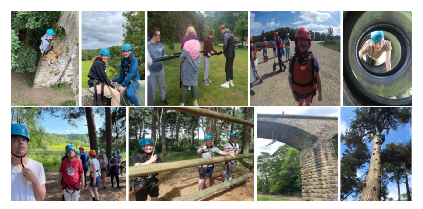
The nurture group have been on their out and about to Dalby Forest and had a great time walking and playing on the park.